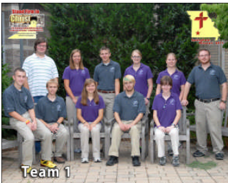
Team 1 The Missouri & Iowa Travel Team with one guest from their host church.