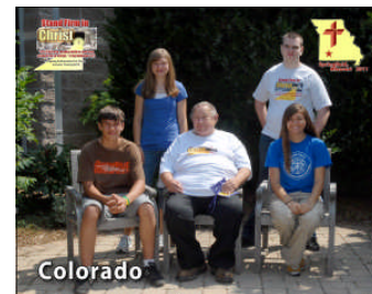
Colorado Three members of the new Colorado group went on Travel Teams.

Thank you to all from the Springfield MO area who help prepare for and host our 2011 Summer Training