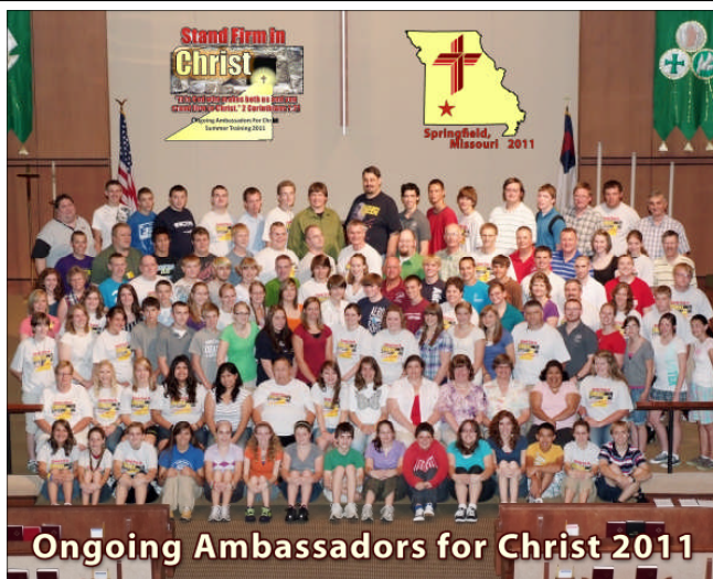
Ongoing Ambassadors for Christ 2011

Check our web site for schedules, Prayer & Praise, and O AFC updates.